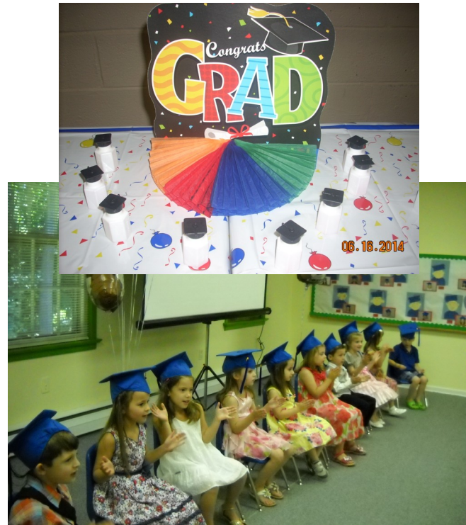
Singing for family and friends